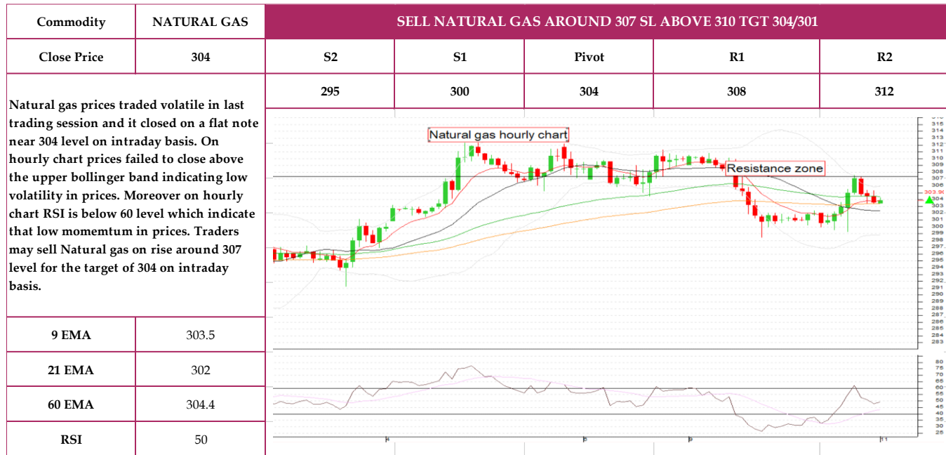
Chart of the day